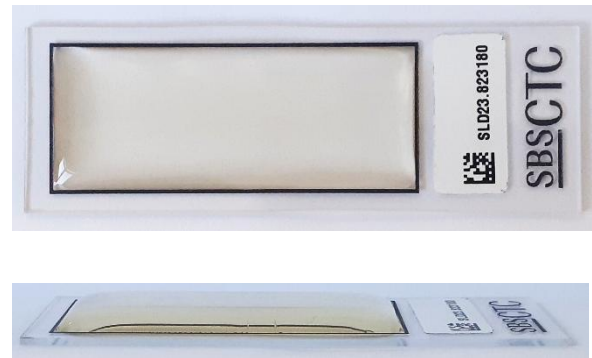
Fig. 2. Image of a SBS slide with 800 µL of cell solution pipetted the cell deposition areas.